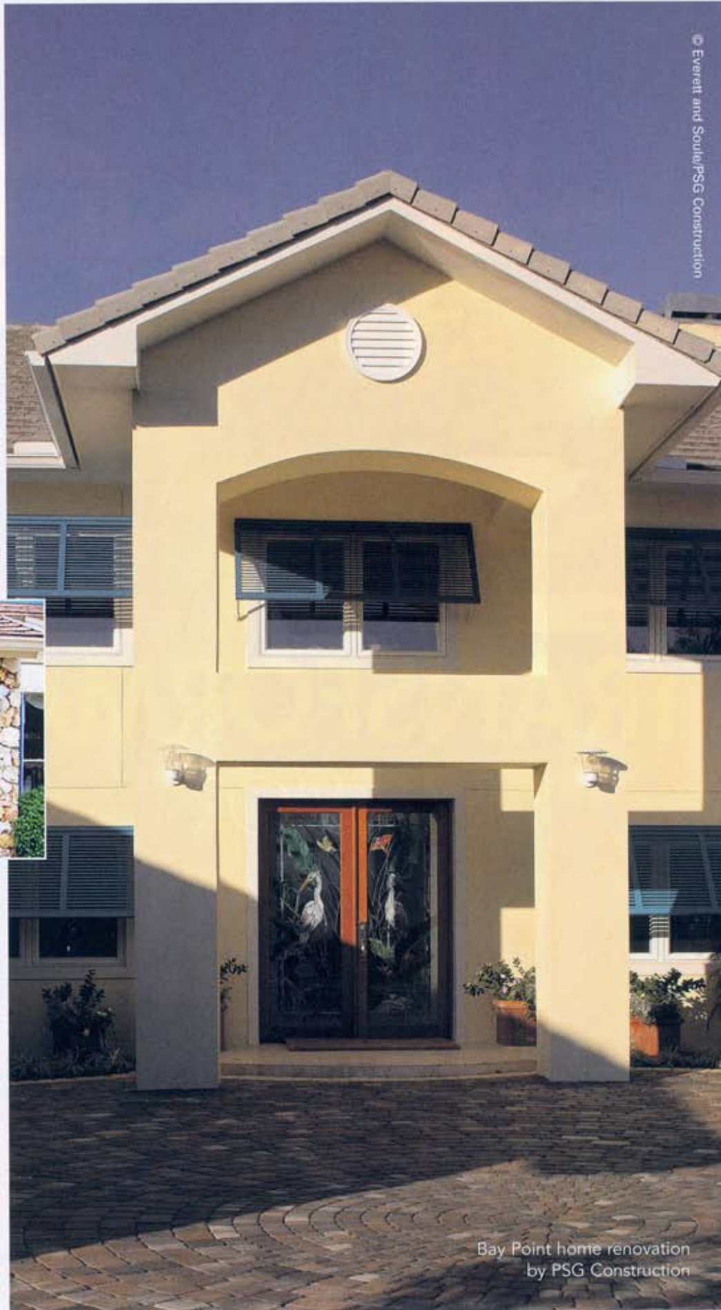
Bay Point home renovation by PSG Construction

The home's bright, clear-blue color palette and spectacular views of Lake Tibet are captivating. "You have a huge