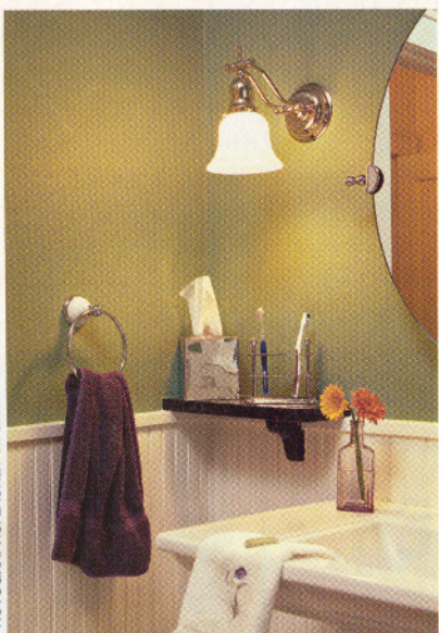
STYLING: ROSE NGUYEN

A master bath in a 1920s Orlando bungalow proves that new construction can have nostalgic appeal.