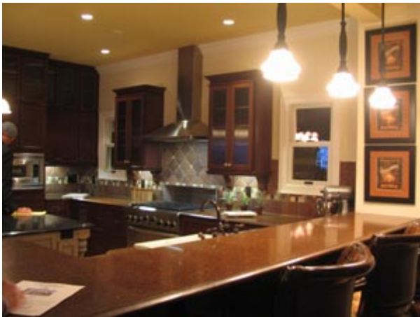
The kitchen in The Renewed American Home

For more news from the IBS, go to the Live Events section.