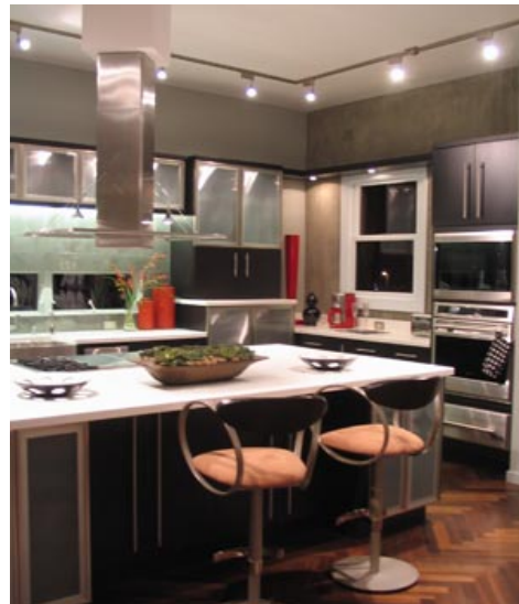
The kitchen in The New American Home.