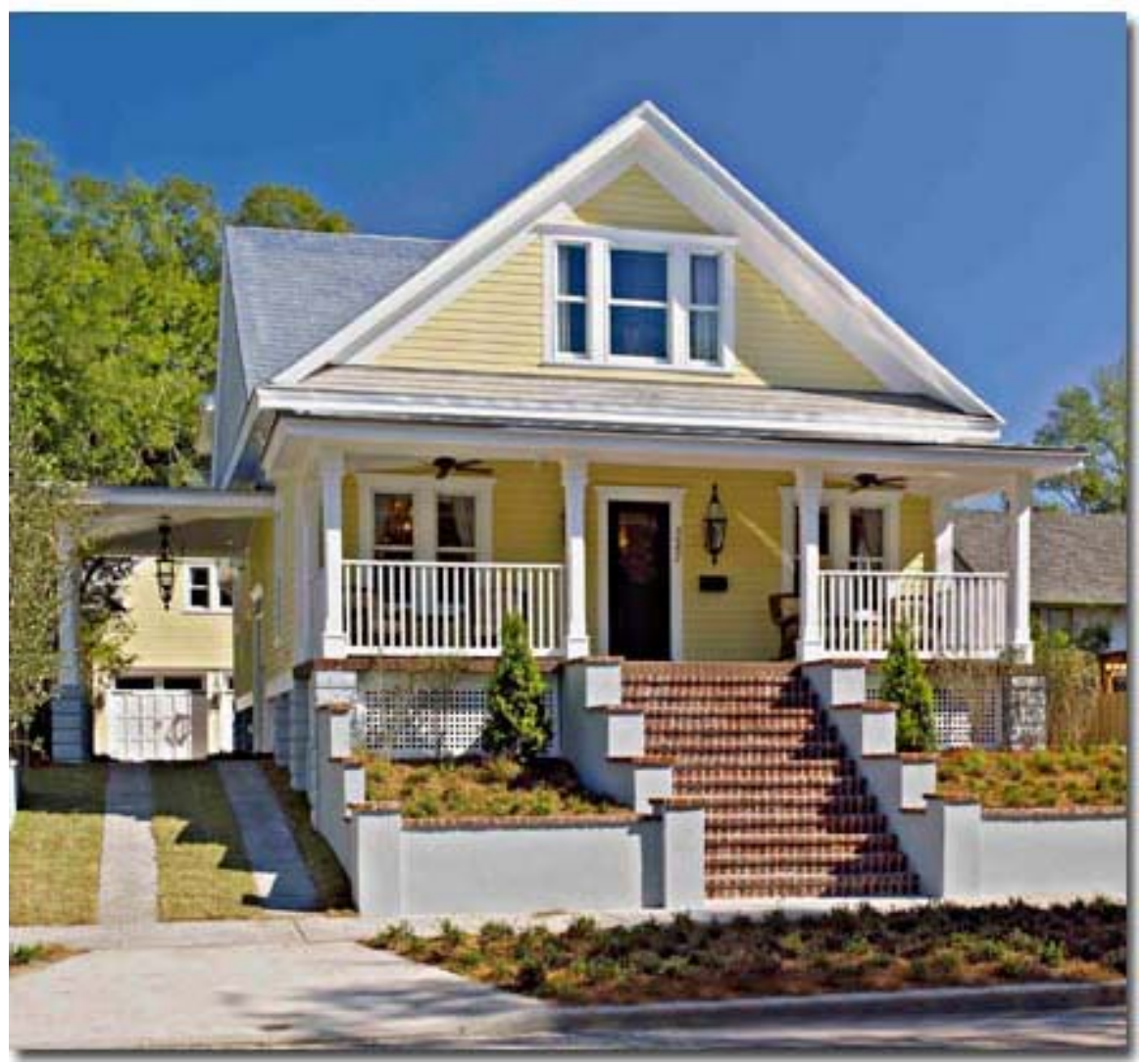
The more traditional Renewed American Home

The New American Home was built to meet NAHB's Model Green Home Building Guidelines and has been certified as a "green" or environmentally-friendly home by the Florida Green Building Coalition, an organization dedicated to eco-friendly construction practices. Among the home's green features are a photovoltaic system, green roof, impact-resistant windows, a generator and a cistern that will collect rainwater for irrigation.