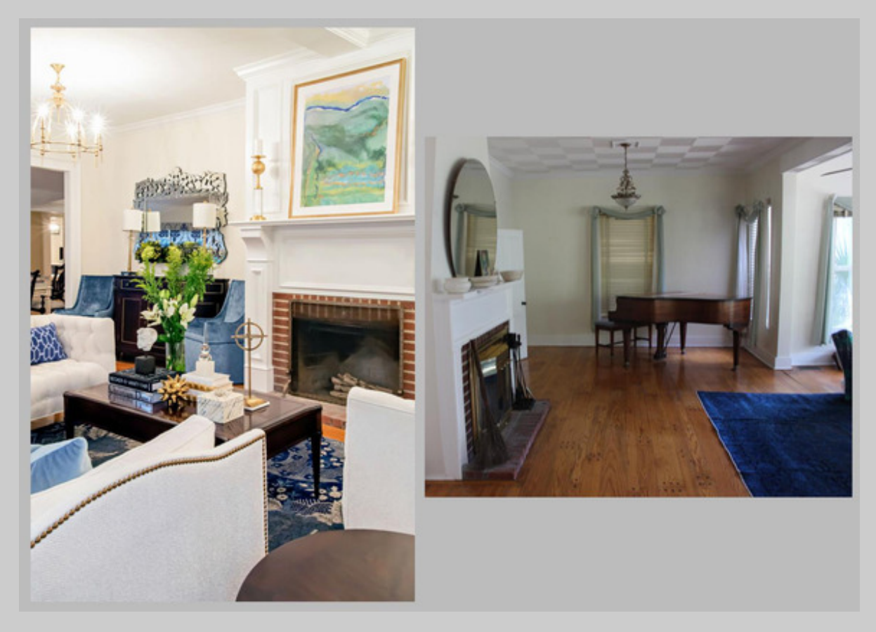
Above left: new fixtures and neutral paint brought the living room back to life. Located just outside of Orlando, the small town of Oakland is like a step back in time. Above right: the existing flooring

Katie Georgelos Photography / Anne Rue Interiors