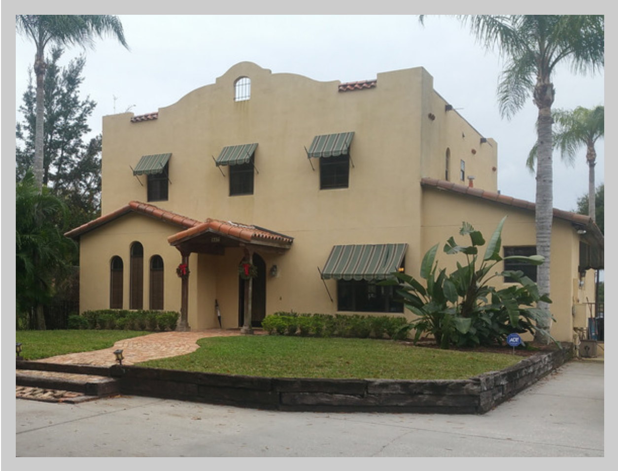
Above: the home before renovation. The two story addition was incorporated to the front of the home.

Historic Renovation Brings Grace Back to Oakland Home